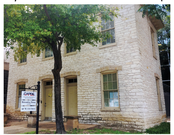
The CAPDS main office is located in the Brizendine House, a historic landmark built around 1870. It is adjacent to the Blackwell-Thurman Criminal Justice Center.

The Capital Area Private Defender Service (CAPDS) is a joint-venture non-profit that was formed by the Austin Criminal Defense Lawyers Association and the Austin Bar Association to operate Travis County's managed assigned counsel program.<sup>68</sup> Management and staff run the organization with the input of an Oversight Committee from the county, a Board of Directors, and a Review Committee.<sup>69</sup>